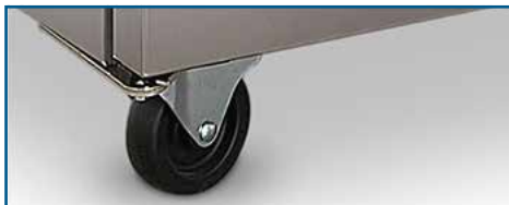
Heavy Duty Casters