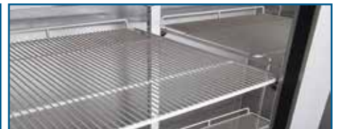
Electrostatically painted Shelves