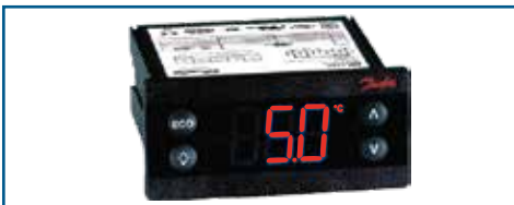
Digital Temperature Controller