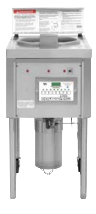
OF49C & OF59C Collectramatic® Open Fryer 8-Channel Programmable Controls